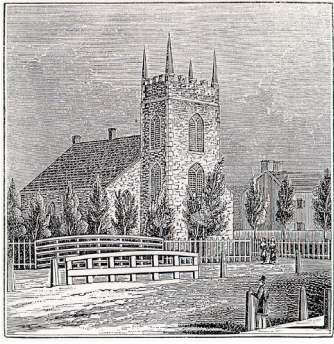
St. Anne's Episcopal Church, c. 1841

streets, and the first church for millworkers of Lowell, St. Anne's Episcopal Church. To attract and keep English and Scottish weavers and printers, he installed a malt brewery. He also built for himself a mansion, situated on the spot where the Boott Mills now stand.